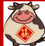
Year of Cow Cookie