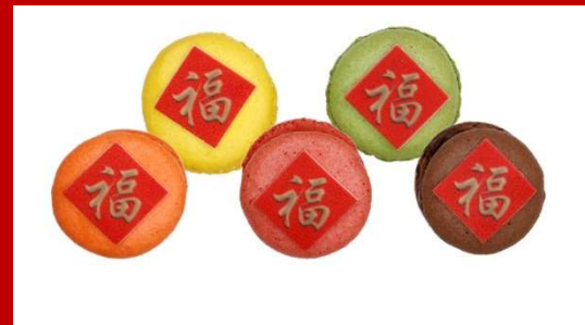
"Best Wishes" Cookies