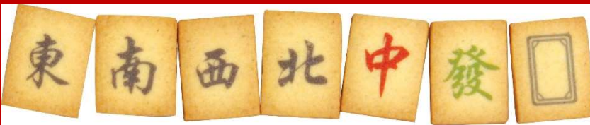
Mahjong Cookie Set