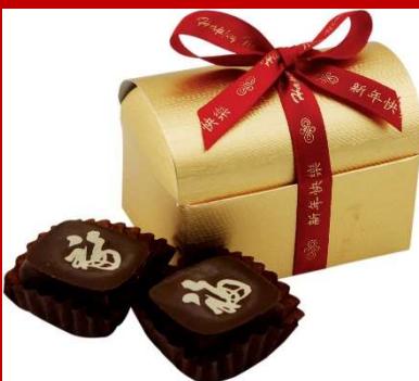
Treasure Box with Praline