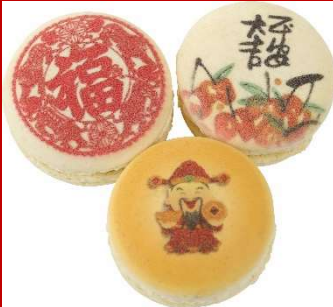
Cashew Nut Macaron