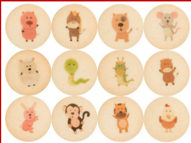
<----- 12 Chinese Zodiac Cookie Set