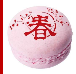
"Spring" Raspberry Macaron