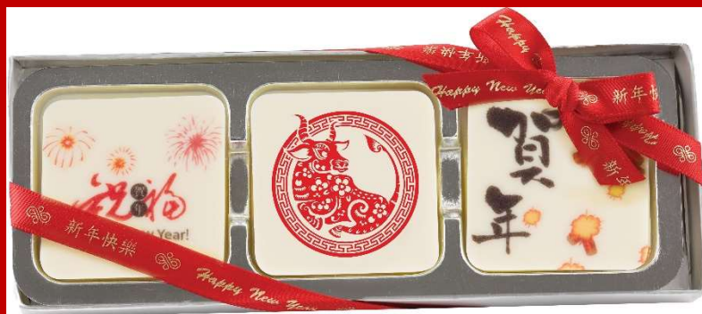
CNY White Chocolate in Silver Box